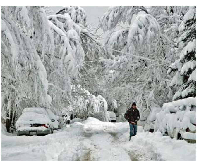
Bolder, Colorado Blizzard