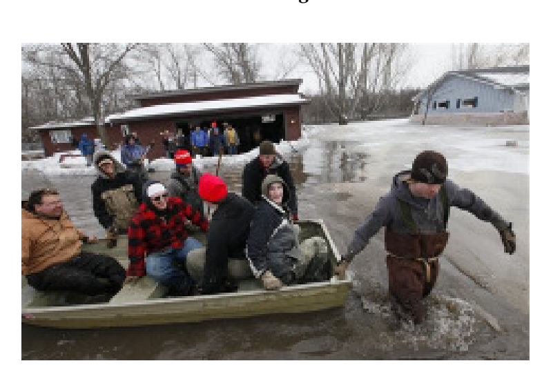
Fargo Red River Flooding