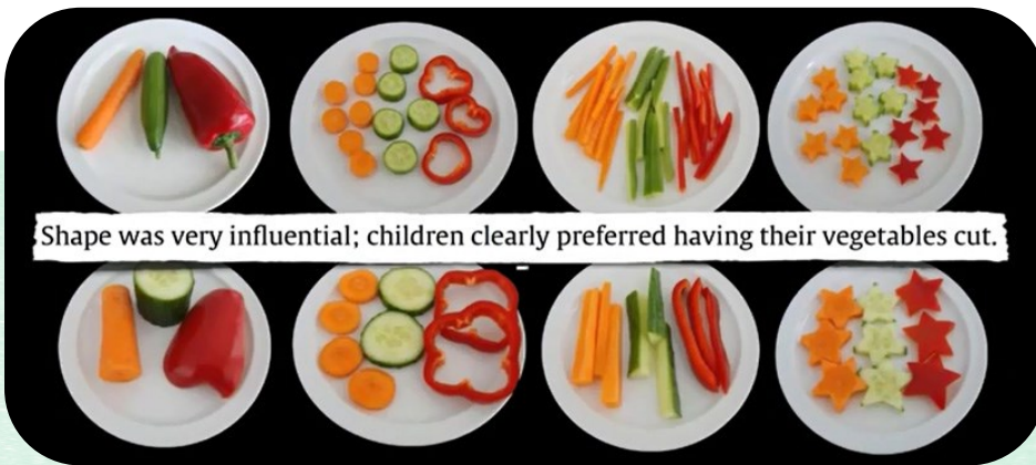
Shape was very influential; children clearly preferred having their vegetables cut.