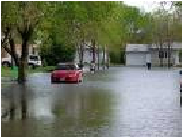
South Dakota Flooding