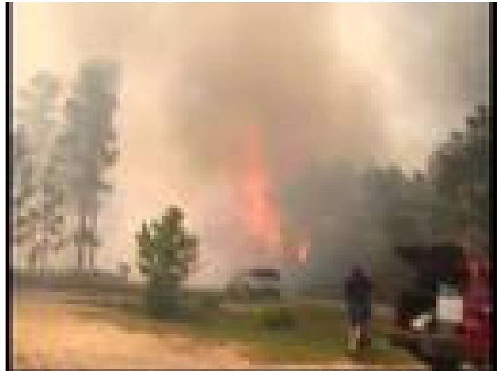
Myrtle Beach, South Carolina Wildfires