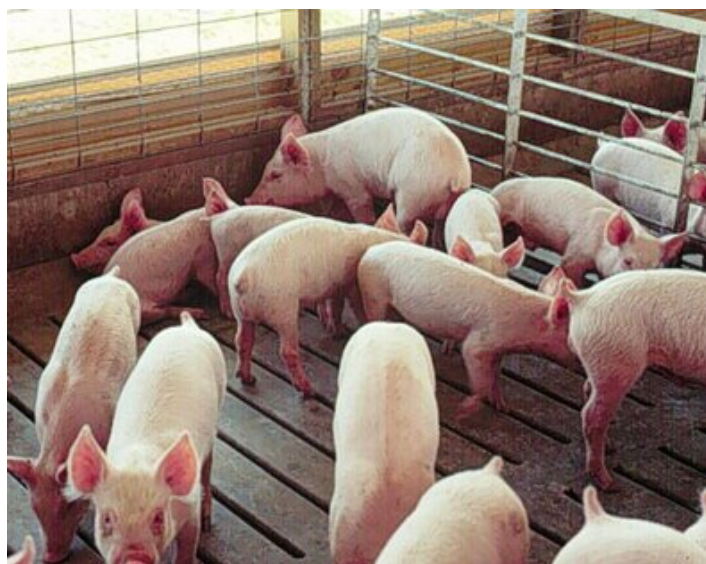
Deadly Swine Flu Epidemic