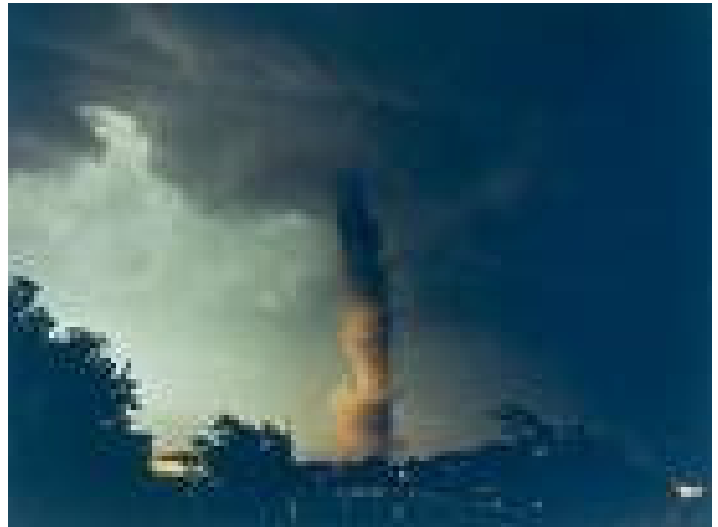
Enid, Oklahoma Tornado